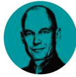
Bertrand PICCARD Initiator and Chairman of the Solar Impulse Foundation